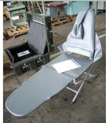
Portable Dental Chair

has been re-sold to a customer, we are required to notify the customer that the DRMS is requesting the return of the item, and that failure to cooperate with the DRMS in recovering the item sought can result in the customer being prohibited from participating in future Government Liquidation or DRMS sales.