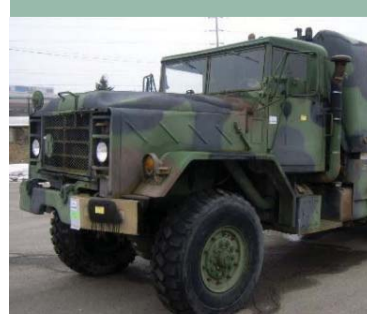
AM General M944A1