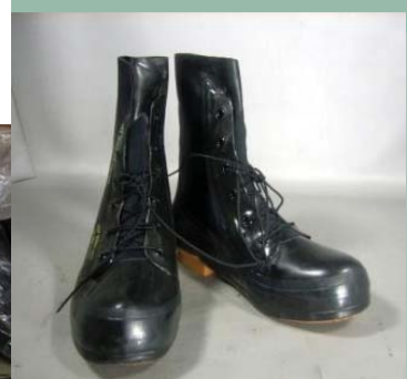
Cold Weather Boots