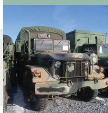
AM General 5 Ton Cargo

Additionally, for those customers who choose not to pay via credit card, this month, Government Liquidation will be adding PayPal as a payment option for purchases totalling $25,000 or less.