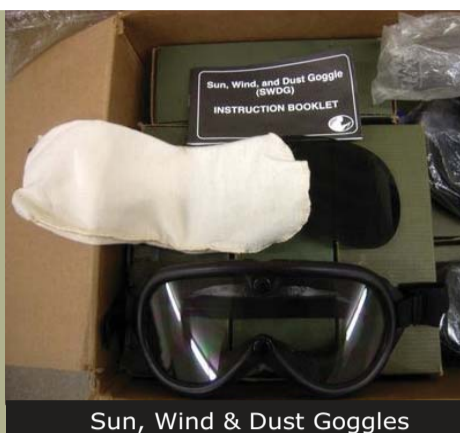
Sun, Wind & Dust Goggles